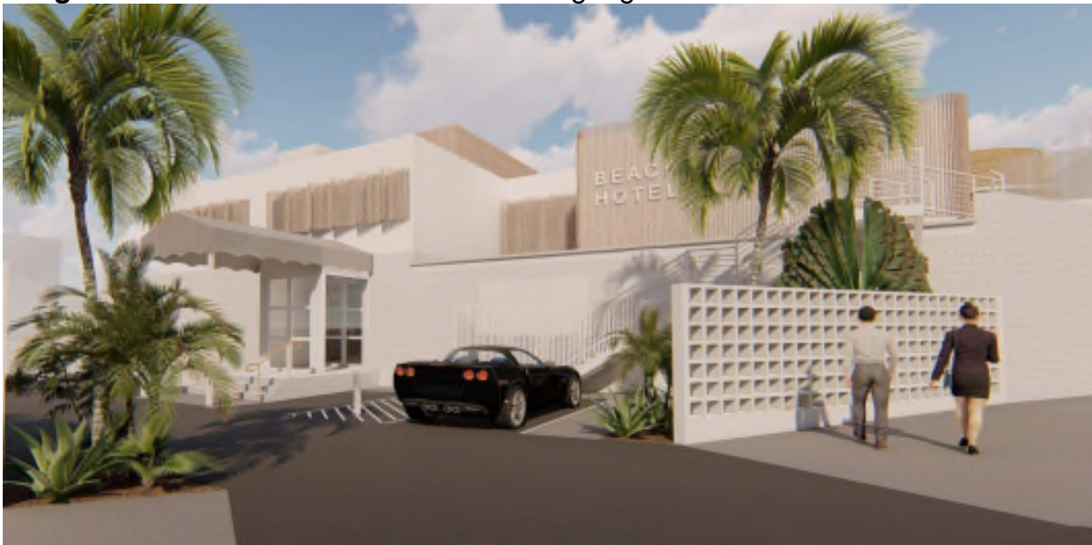
Source: Amended architectural plans photo montages - Drawing A16

The proposed signage is considered acceptable having regard to SEPP 64 requirements and the nature of the development and does not contravene the provisions of Schedule 1 of the SEPP.