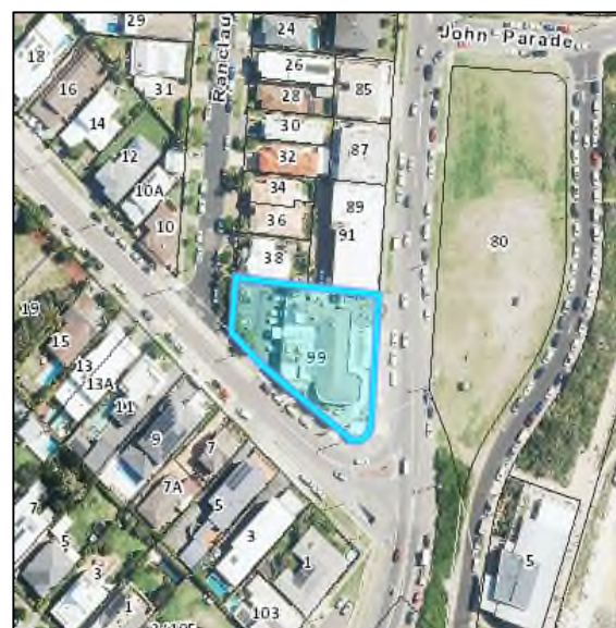
Subject Land: 99 Frederick Street, Merewether