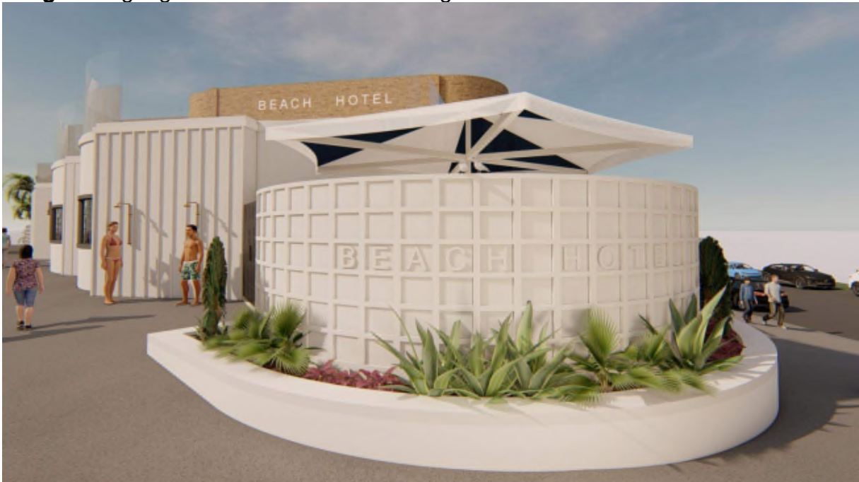
Source: Amended architectural plans photo montages - Drawing A15