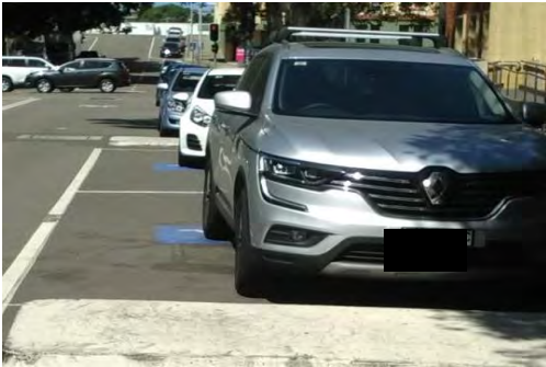
Above: Auckland St, between King & Hunter St 2 spaces