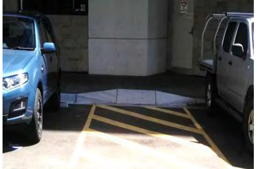
Right: Laman St, 2 spaces Left: Burwood St, western side of Tax Office 3 spaces