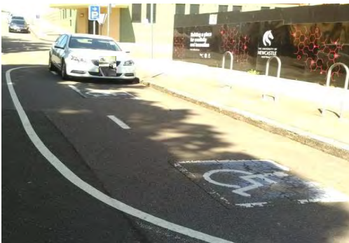
Below: Auckland St, between King & Gibson 2 spaces