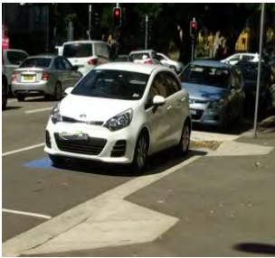
Left: Auckland St, Accessible spaces with kerb ramps