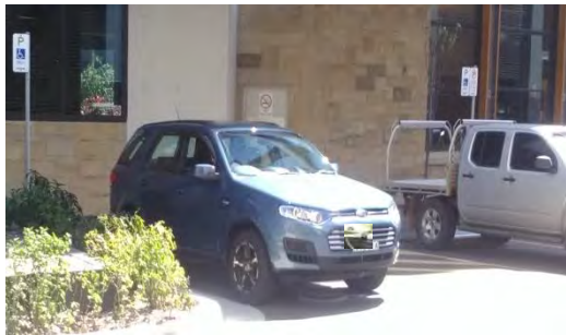
Above: Burwood St, eastern side of court house building, 2 spaces, includes option to park to align passenger or driver side, see below kerb ramp, same location