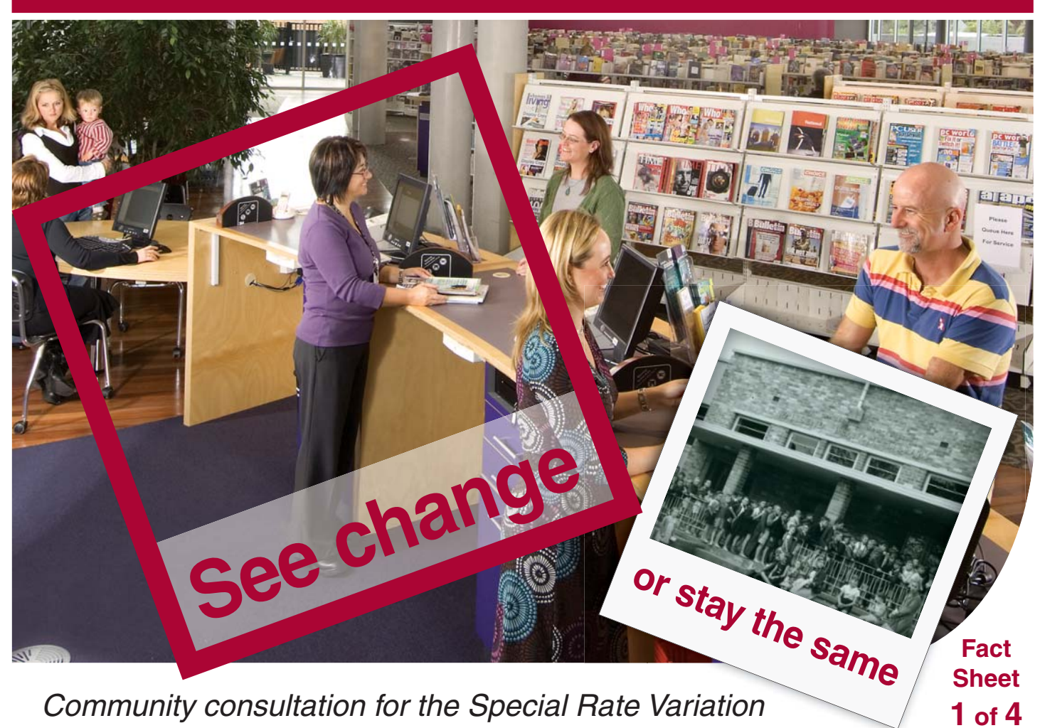
Community consultation for the Special Rate Variation