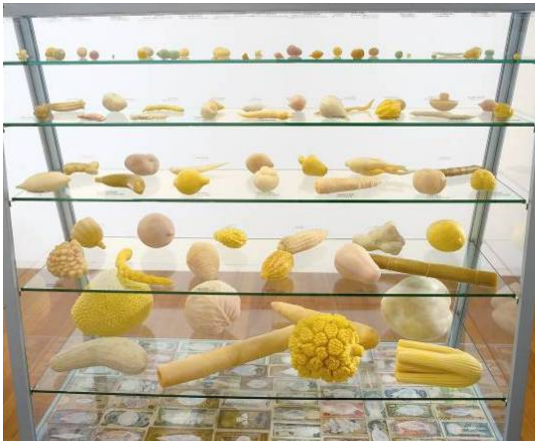
Fiona Hall Cash Crop 1998 soap, gouache on banknotes, labels, vitrine vitrine: 132 x 130 x 160cm Collection: Art Gallery of New South Wales, Sydney – Contemporary Collection Benefactors Program 2000 © the artist