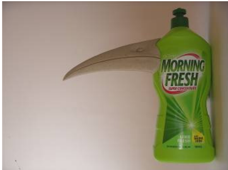
Fiona Hall Mourning Chorus (2007 – 08) (detail) resin, plastic, vitrine dimensions variable