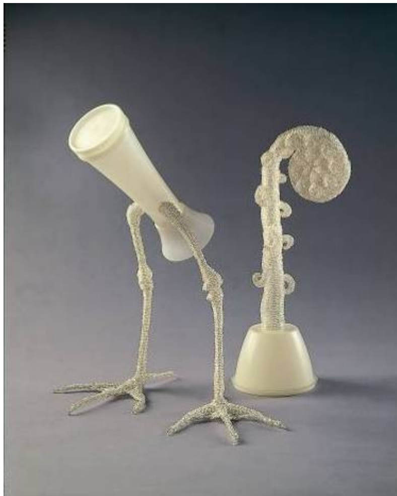
Fiona Hall Cell Culture 2001-02 (detail) glass beads, silver wire, Tupperware, vitrine vitrine: 157 x 247 x 90 cm South Australian Government Grant 2002, Art Gallery of South Australia

Museum of Contemporary Art, Sydney 6 March – 1 June 2008