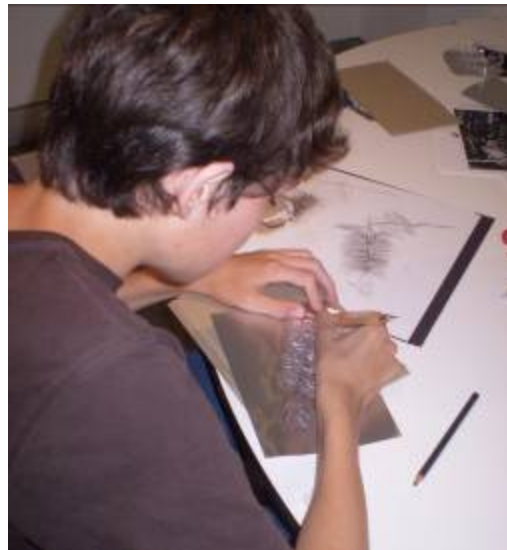
Embossing the drawing design into the metal surface.