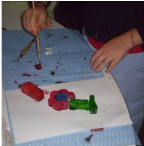
Painting the carving with food colouring.