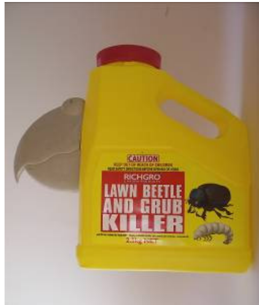
Fiona Hall Mourning Chorus (2007 – 08) (detail) resin, plastic, vitrine dimensions variable Courtesy of the artist and Roslyn Oxley9 Gallery, Sydney, Australia © the artist

'Online Collection' (search results for 'birds'), Te Papa Tongawera Museum of New Zealand website, http://collections.tepapa.govt.nz/Search.aspx?imagesonly=on&advanced=colCollectionType%3ABirds