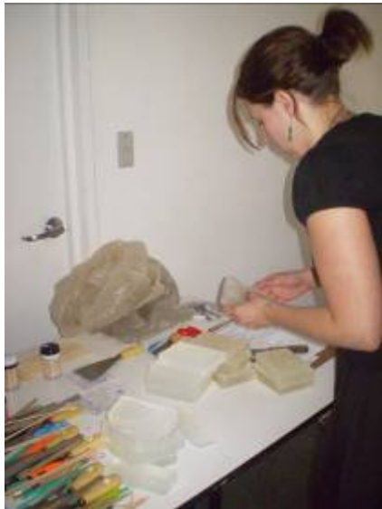
Sectioning the soap. Photograph: Justine McLisky, 2008