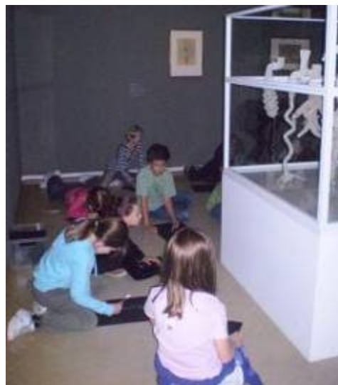
Drawing Dead in the Water (1999). MCA School Holiday Programs, April 2008

Select one item in Dead in the water (1999). Use white pencil to draw the "above" and "below the water" views on two sheets of black paper. Use the pencil to try to capture the surface detail of the objects, and leave areas of black paper to show the negative spaces.