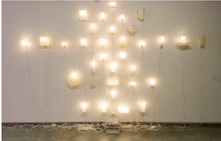
Polyethylene containers, ceramic plate, electrical components, dimensions variable Museum of Contemporary Art, purchased 1995 © the artist photograph: Jenni Carter

The Price is Right is a major installation constructed from unassuming polyethylene 'Tupperware' containers. Sensor-activated lights flash Morse code from inside the opaque containers when viewers approach, cumulatively spelling out the sentence "I have the misfortune of not being a fool". The work's obscure Morse code message is a line appropriated from Charles Dickens' 1857 rags-to-riches tale Little Dorrit , a book which cautions against precisely the kind of "get rich quick" aspirations now promoted by television game shows, such as the one which gives the work its title.