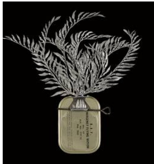
Holdfast (Macrocystis angustifolia) 2007 tin, aluminium 27.5 x 27.2 x 2 cm

Fiona Hall: Force Field aims to reveal a kind of archaeological layering of the artist's formal and conceptual concerns, as well as continuities in her practice over time. Not only is her work remarkable for the consistency of its ideas and interests, but also for its relentless pursuit of new artistic possibilities and its capacity to engage with shifting social and environmental conditions. 1