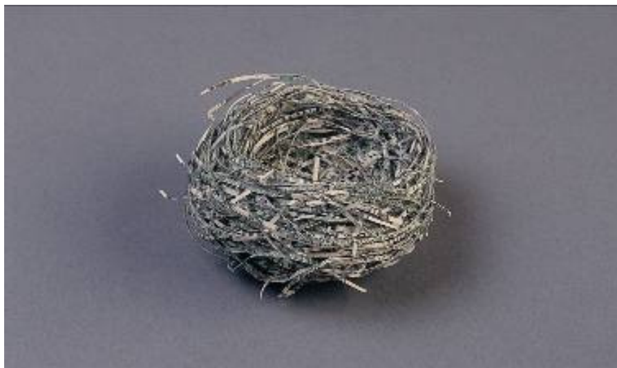
Fiona Hall Tender (details) 2003 – 05 US dollars, wire, vitrines 220 x 360 x 150 cm (installed, approx.) Collection: Queensland Art Gallery © the artist