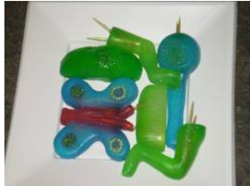
Sections ready to join by toothpick.