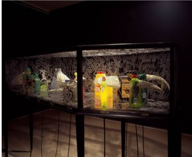
Fiona Hall Mourning Chorus (2007 – 08) resin, plastic, vitrine dimensions variable Courtesy of the artist and Roslyn Oxley9 Gallery, Sydney, Australia © the artist. Photograph: Greg Weight