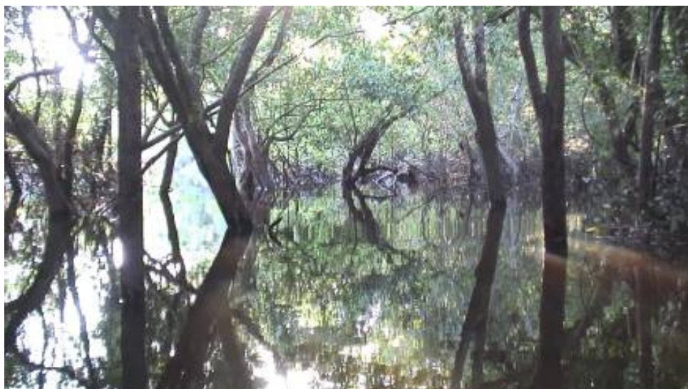
Fiona Hall Amazonical 2007 (stills) video 12:25 minutes Courtesy of the artist and Roslyn Oxley9 Gallery, Sydney, Australia © the artist