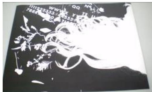
Student examples of photograms, MCA Bella Workshop April 2008.