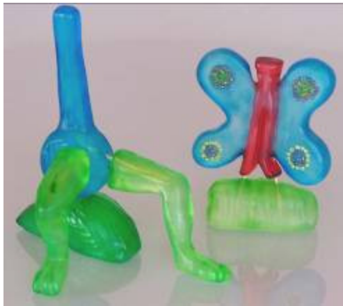
Soap carving examples.