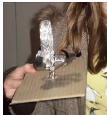
Student example of metal embossing and filigree sculpture, MCA 2008

Teachers can adapt the Metal Embossing activity in this kit to suit Secondary students, and extend it to relate to Fiona Hall's Paradisus Terrestris series. Students can use scissors to extend the flat relief works into filigreed works which stand on a plinth by cutting, folding and arranging the edges of the piece to make this a three-dimensional sculptural object. Students can extend the repoussé technique by working through the back of the metal to make works which are highly modelled.