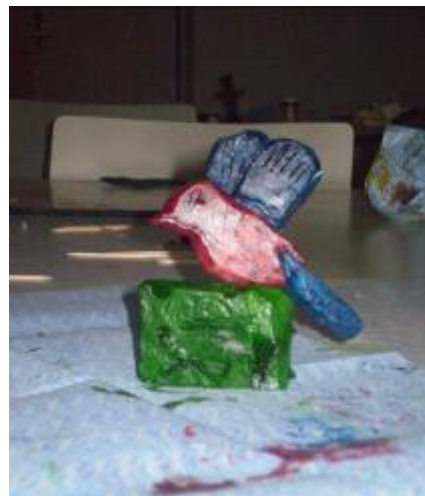
Bird/camera hybrid soap carving.