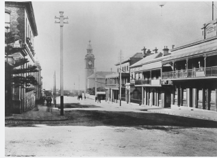
PHOTO: Looking north along Watt Street, c. 1900.