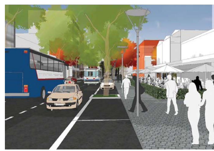
Artists impression, Hunter Street revitalisation

Council is also conducting a telephone survey of 400 residents to seek their views. You may be randomly selected to participate in this quick survey during September/October.