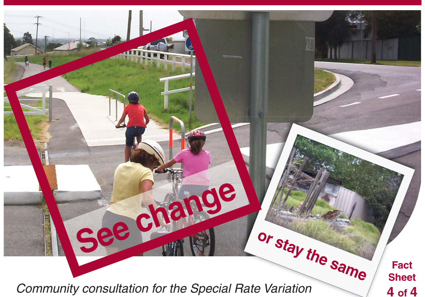
Community consultation for the Special Rate Variation