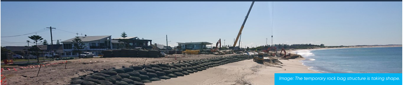
Image: The temporary rock bag structure is taking shape.