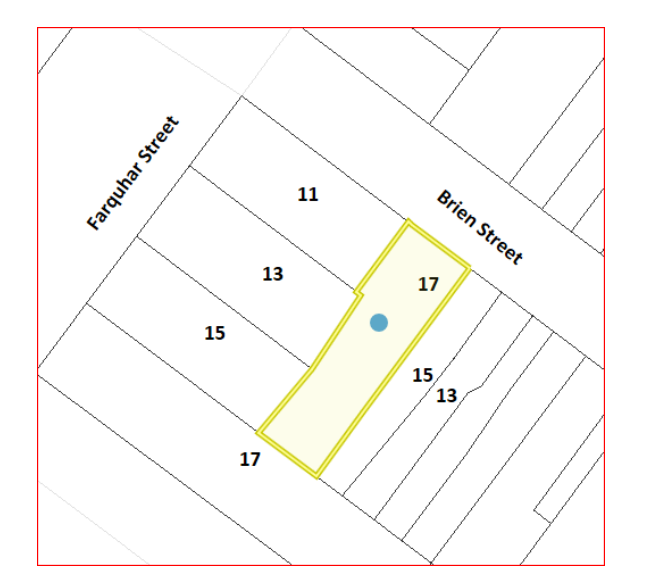
Subject Land: 17 Brien Street The Junction