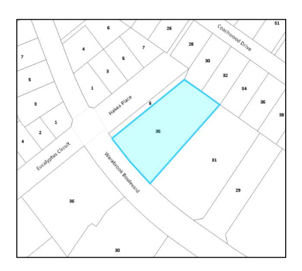
Subject Land: 35 Warabrook Boulevard Warabrook

The application was publicly notified in accordance with City of Newcastle's (CN) Community Participation Policy (CPP), with 133 submissions being received.