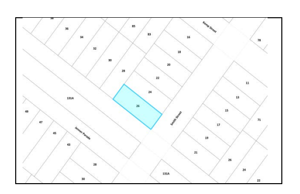
Subject Land: 26 Smith Street, Hamilton South

The application will be referred to the Development Applications Committee for determination, due to the number of public submissions received. A total of 40 submissions were received objecting to the proposal and 5 submissions were received in support of the proposal.