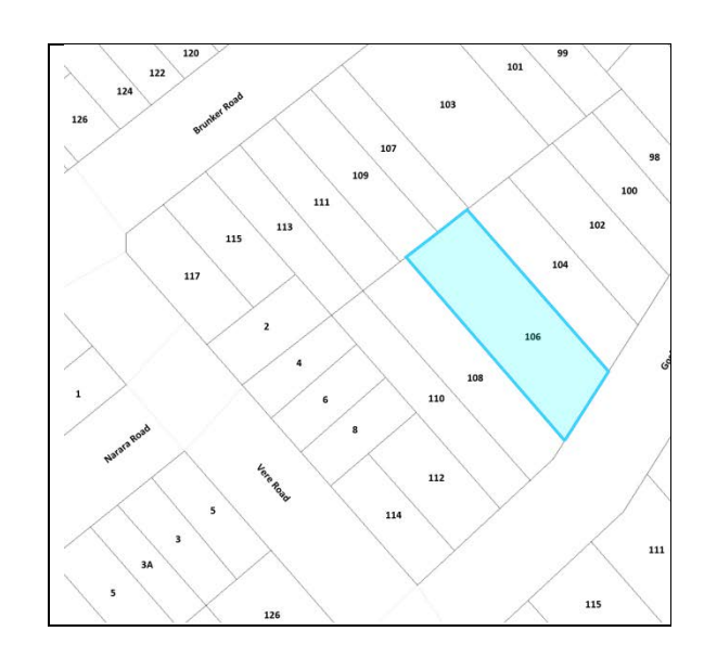
Subject Land: 106 and 108 Gosford Road Adamstown

The application was publicly notified in accordance with City of Newcastle's (CN) Public Participation Policy, with 15 submissions being received.