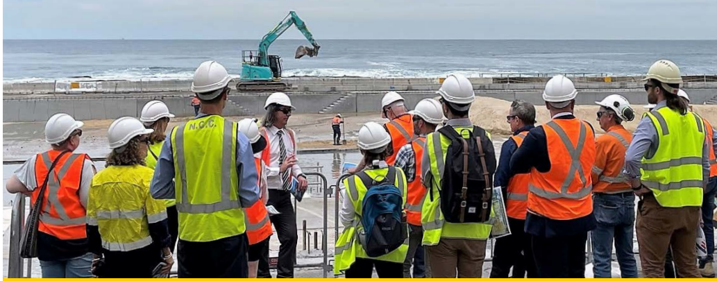
Pictured right: Members of the Newcastle Ocean Baths Community Reference Group undertook a site tour and project briefing in December