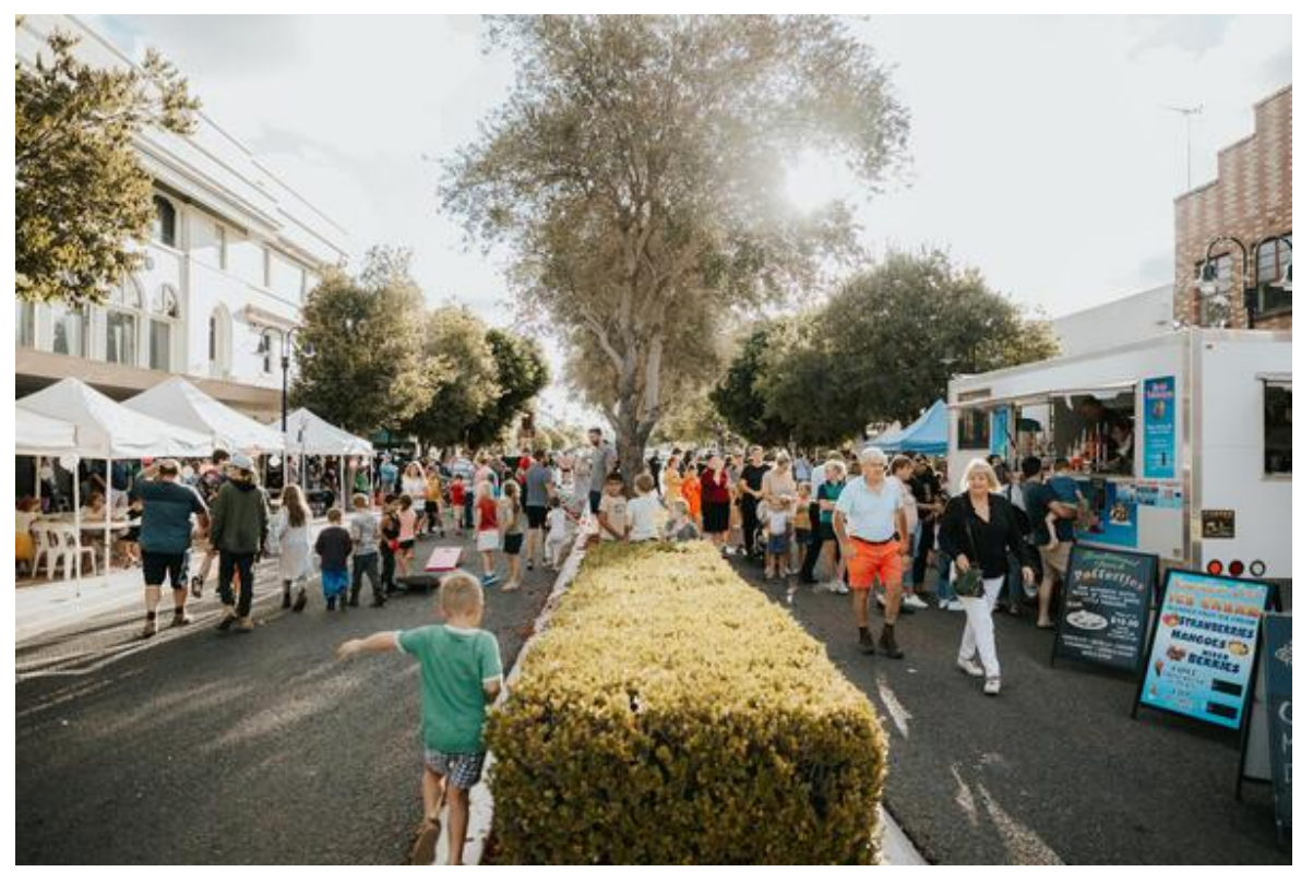
MyMoree by the Moonlight, Summer Night Fund.

The Package builds on significant and continued investment into our public spaces in transport hub precincts, including our streets, roads and laneways, that play a critical role in supporting local businesses, community connection and physical and mental well-being.