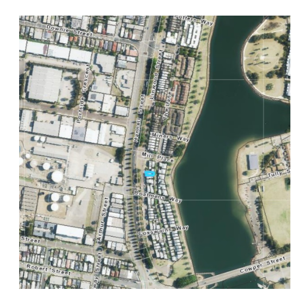
Subject Land: 76 Linwood Street Wickham

A copy of the plans for the proposed development is included at Attachment A .