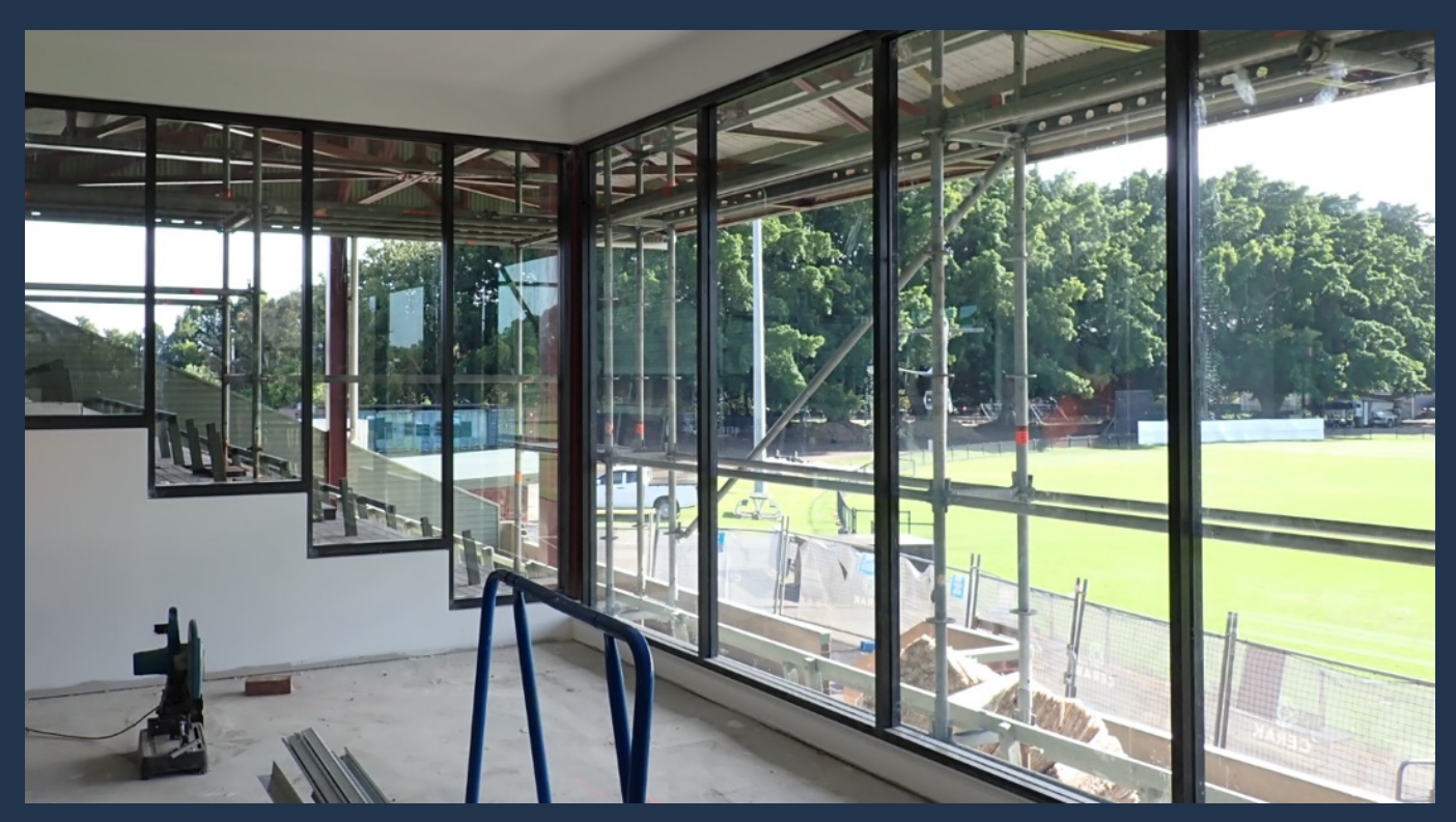
Underway: Upgrades to Passmore Oval Grandstand Wickham

City of Newcastle deliver a range of capital works projects to renew and upgrade city infrastructure. For further information about major projects and works, please see newcastle.nsw.gov.au/works