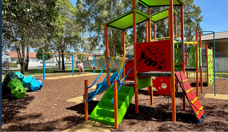
The newly upgraded playground at Vera Wilson Park, Beresfield.