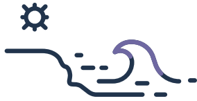
Coastal Management Planning and Erosion Management, especially at Stockton Beach