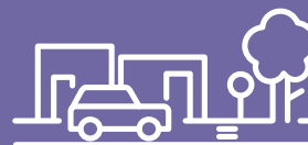
Local Centres Program