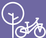
Newcastle East End Streetscape Upgrades and Cycleway