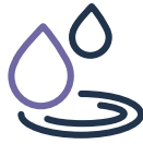
Flood mitigation at Wallsend