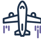
Newcastle Airport Expansion