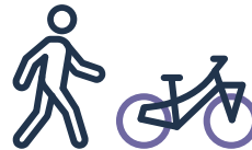
Metropolitan wide active transport (walking & cycling) improvements