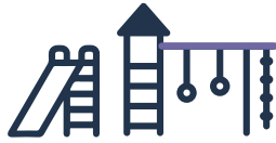
Local Playground upgrades, particularly for disability inclusion