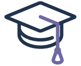
University of Newcastle STEM Regional Transformation Hub