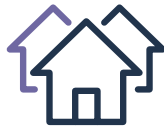
Affordable housing initiatives