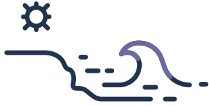
Coastal Management Planning and Erosion Management, especially at Stockton Beach